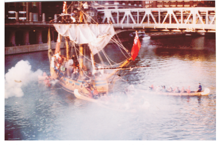
The Nonsuch under attack by voyageurs in Chicago (1969)

prepared and as 75 voyageurs in ten canoes converged on the vessel, they were met with a barrage of cannon fire followed by volleys of flour bombs. Notwiths tanding this defensive action, the assailants prevailed and were soon in possession.